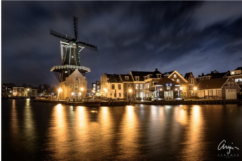
Adriaan Windmill, Haarlem